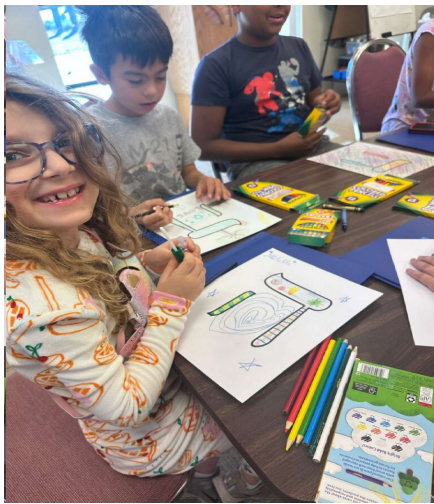
Learning our Hebrew Letters and