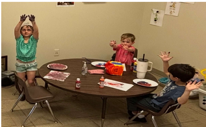
Our preschoolers having fun, too!