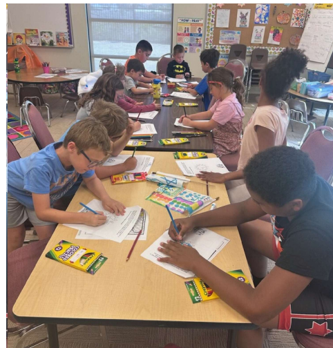
Studying all about Shabbat