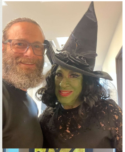
We came, we saw, we hamantaschen'd