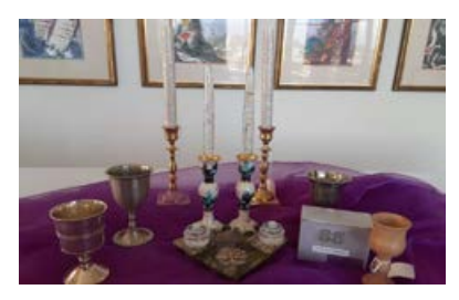
Would colorful Shabbat and Havdalah candles bring another