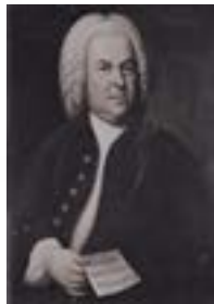
Brandenburg Concerto No. 5 BWV 1050 Johann Sebastian Bach

Congregation Emanu El 1495 Ford Street, Redlands, CA 92373 909.307.0400 / www.emanuelsb.org