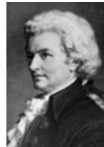
Grande Sestetto Concertante K. 364 (320d) Wolfgang Amadeus Mozart