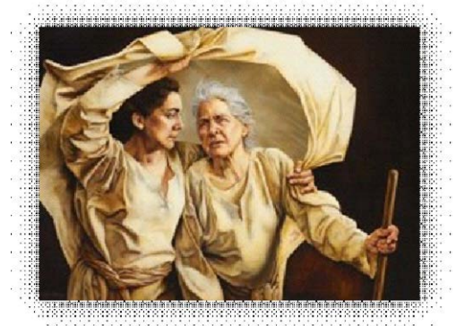
"Where you go, I will go."