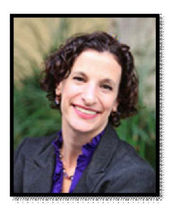
Meet Our New Rabbi!

Sunday, June 3, 2018 9:30 a.m. to 12:00 Noon