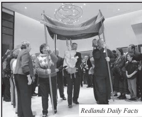
Redlands Daily Facts